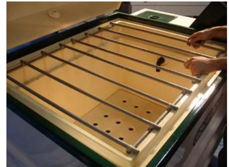
Internal View – ITEQ 600